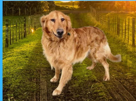
Goldie (Golden Retriever)