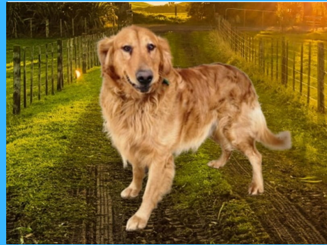
Goldie (Golden Retriever)