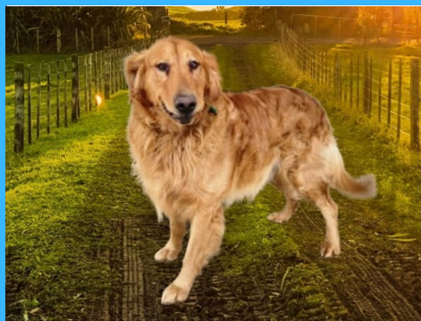
Goldie (Golden Retriever)