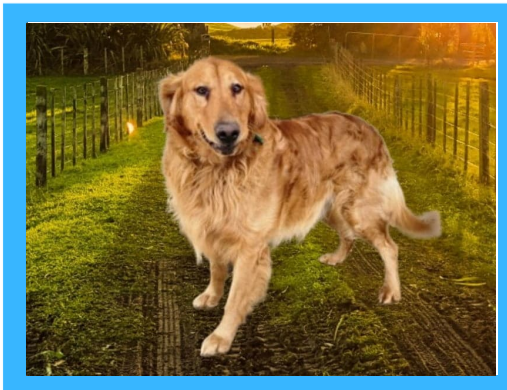
Goldie (Golden Retriever)